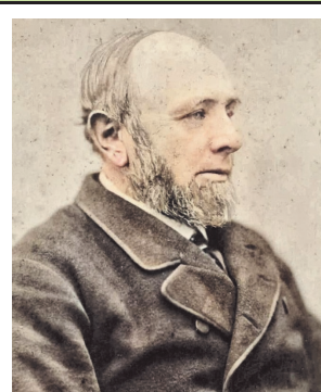
THOMAS AVELING Father of the Traction Engine

Initially, the family probably lived near St. Werburgh Church, along Church Street.